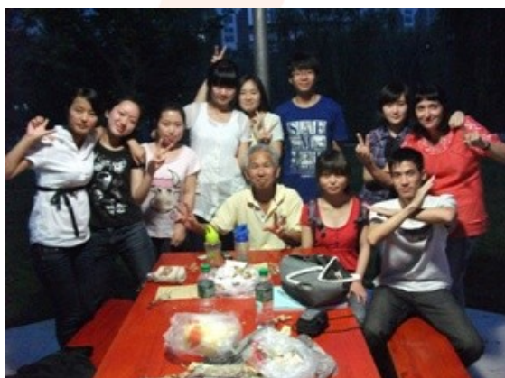
Calvin's English Corner

For more information about volunteer teaching programs in China or Vietnam, please contact Info@AsiaLiteracy.org.au