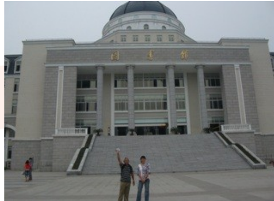
Jincheng College Library

built in anticipation of an ever increasing student population in 2012.