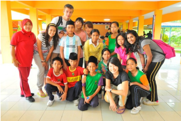
School Visit in Malaysia