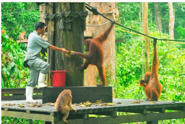
Orangutan's in Sabah, Malaysia