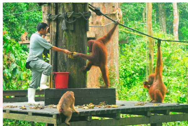
Orangutan's in Sabah, Malaysia